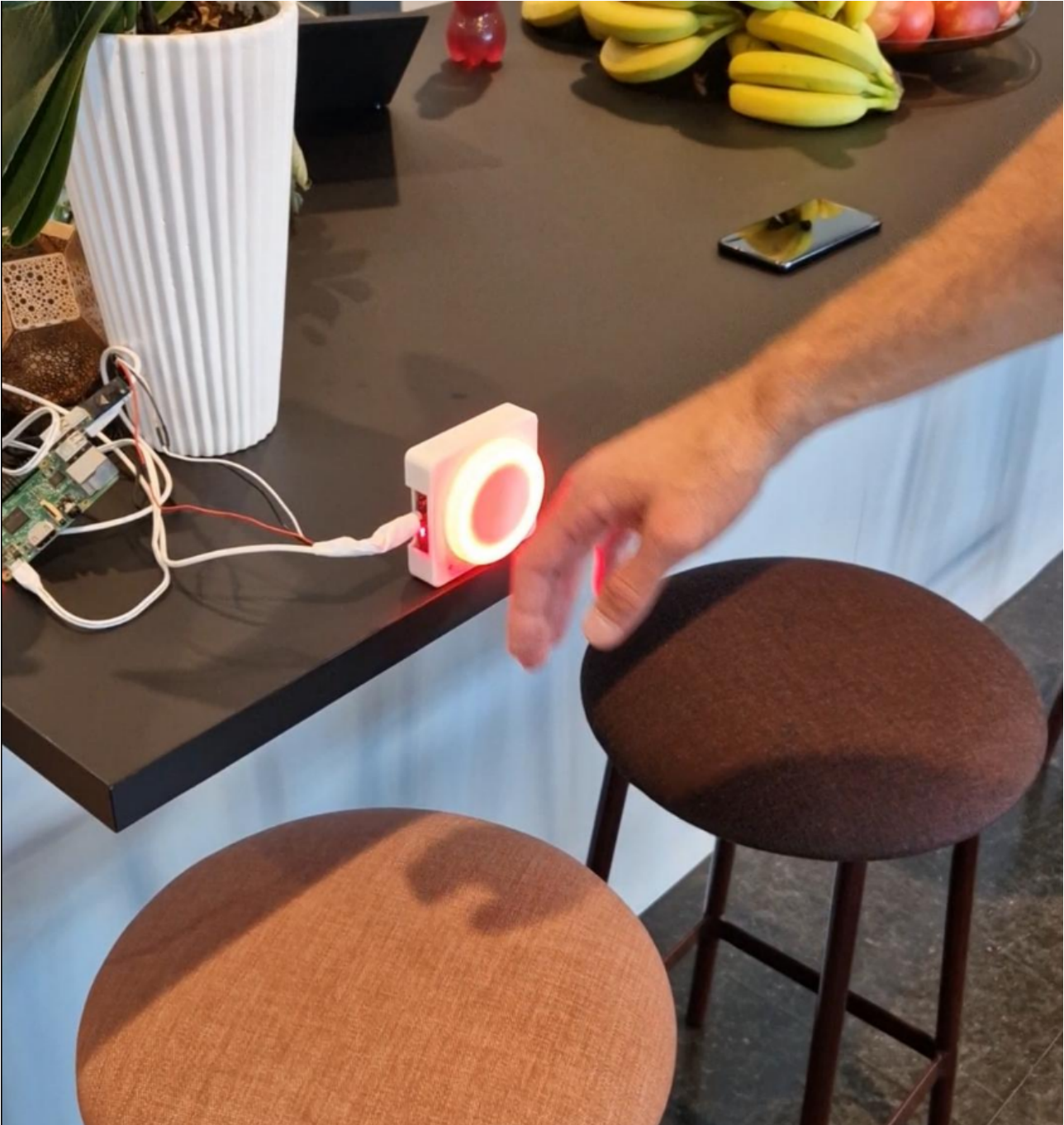
Figure 3: Shows the setup and action used in the persons test.