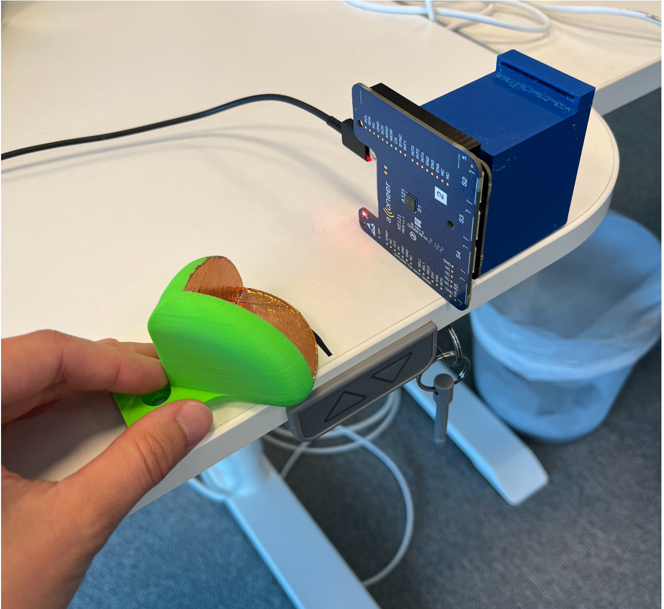
Figure 2: Test setup to test preset ranges, to ensure no detection outside the range.