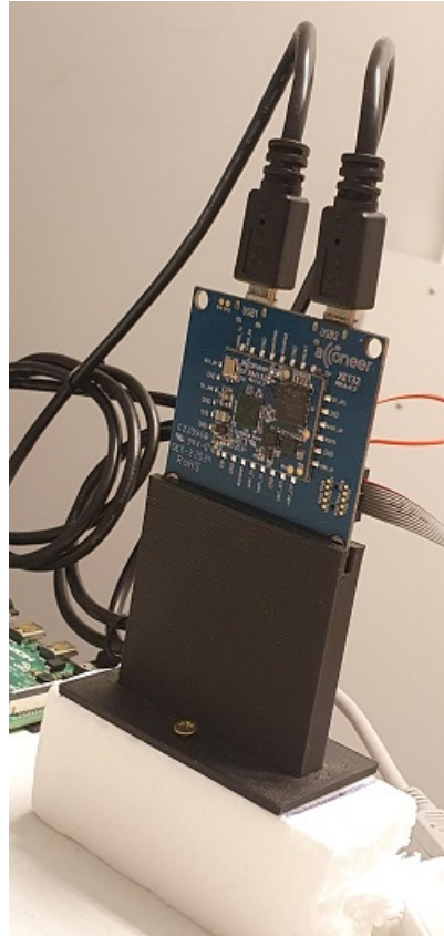
Figure 2: XM132 holder