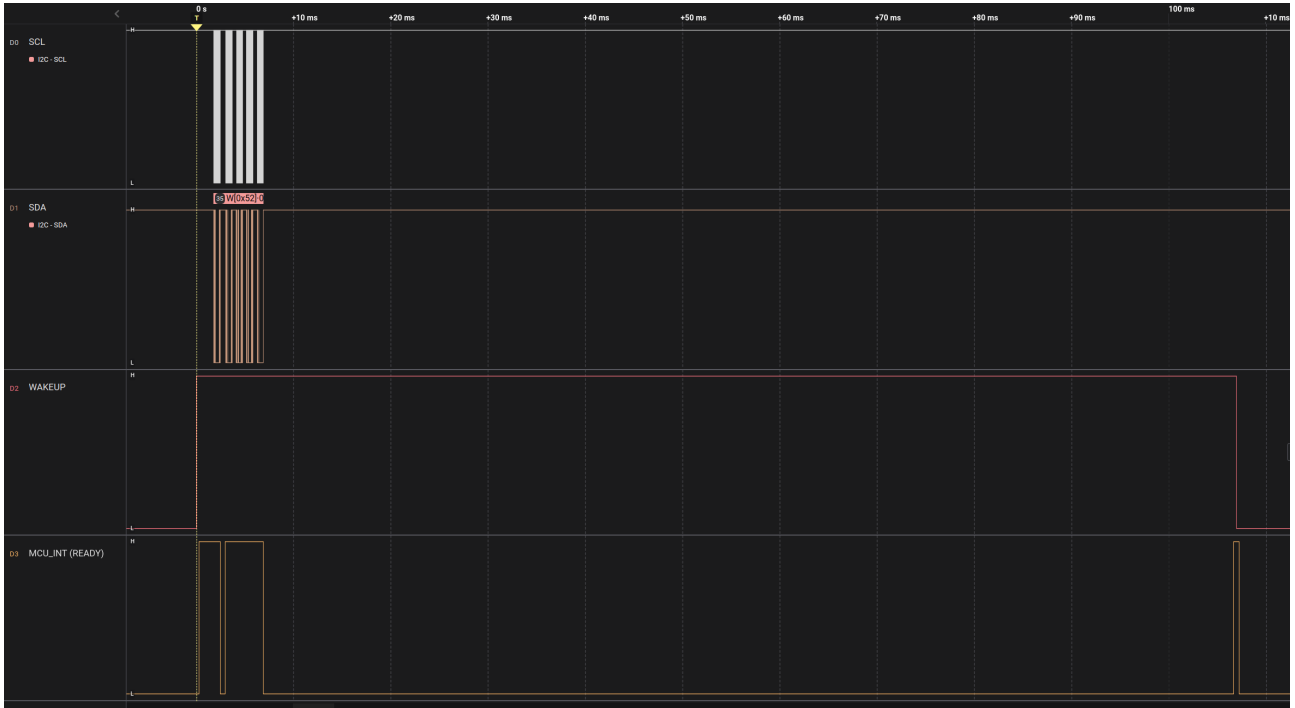
Low Power Example: Magnification of Wake up, Setup Ref App Breathing, Power down